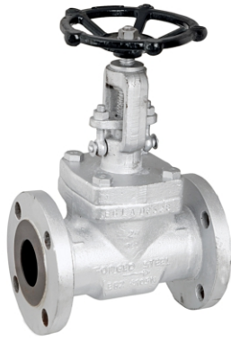
TYPE LGLF - 250