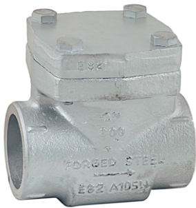
TYPE LPCF - 325