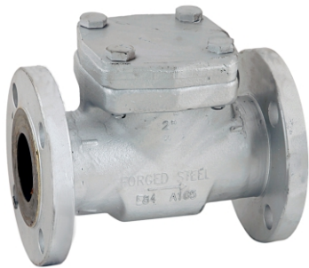
TYPE LPCF - 325