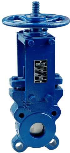
TYPE LKGC - 225